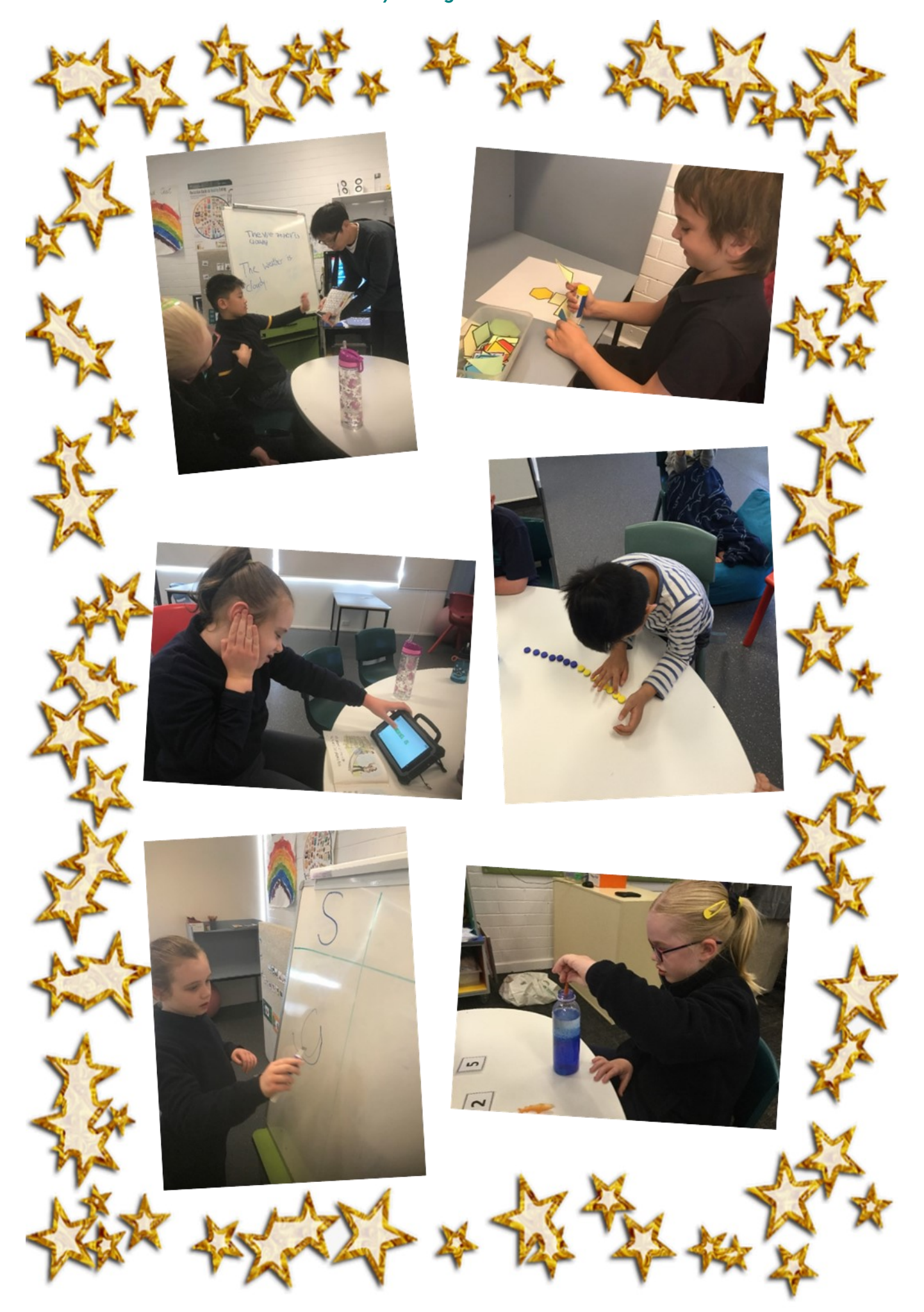
Commitment, Opportunity, Respect & Excellence